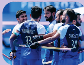
Indian Hockey Team