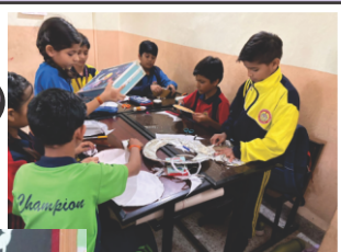
BEST OUT OF THE WASTE