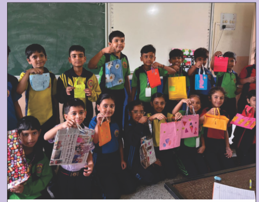
"Heal the Home" It's the only home we have!.