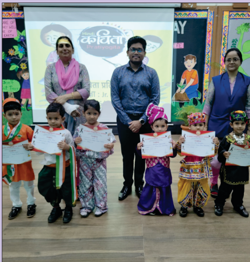
कविता का जादू बच्चों की जुबान पर!