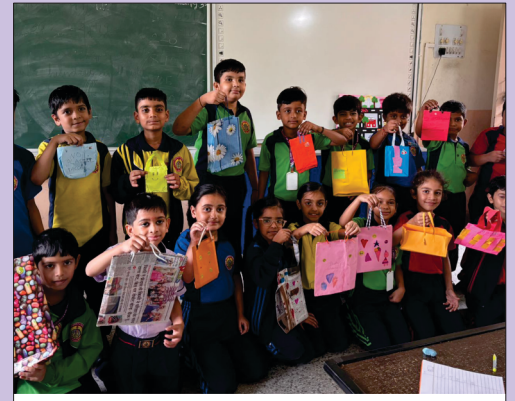
“Heal the Home” It's the only home we have!.