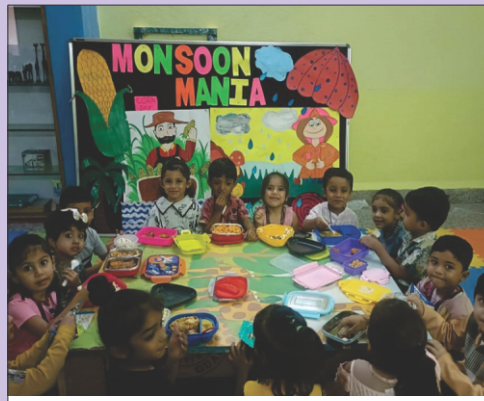
MONSOON RAINDROPS & MEMORIES