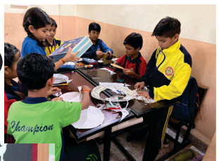
BEST OUT OF THE WASTE