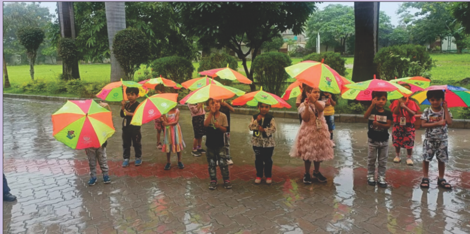
Let's get Muddy and Messy with learnings