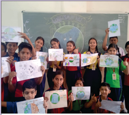
Let's give Mother Earth A Big Hug