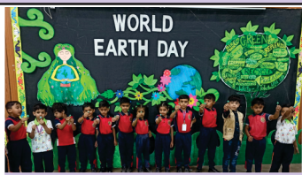
WORLD EARTH DAY