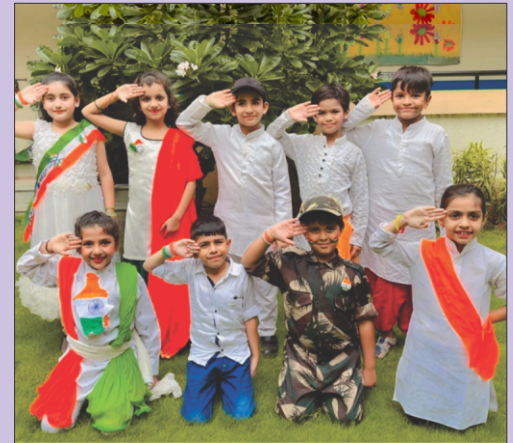
Fervour of Tricolour The True Holi of India!