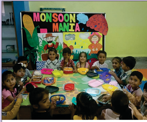
MONSOON RAINDROPS & MEMORIES