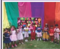
CARNIVAL OF COLOURS