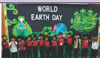
WORLD EARTH DAY