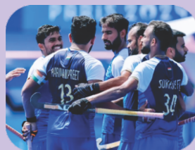
Indian Hockey Team