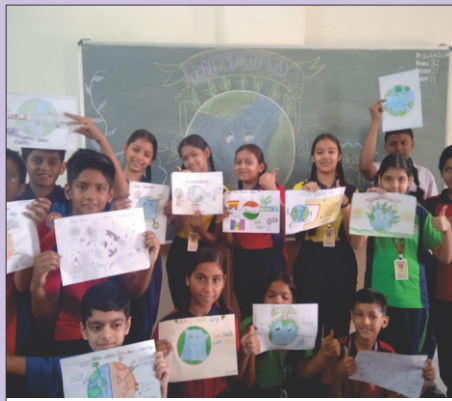
Let's give Mother Earth A Big Hug