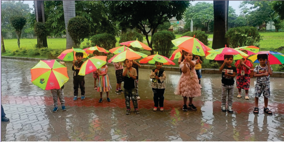
Let's get Muddy and Messy with learnings