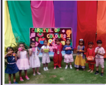
CARNIVAL OF COLOURS