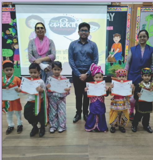
कविता का जादू बच्चों की जुबान पर!