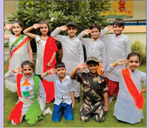
Fervour of Tricolour The True Holi of India!