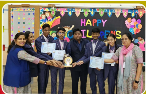
Our champions secured best Aim and Utility - Computer science, in Indore Sahodaya Bal Vigyan.