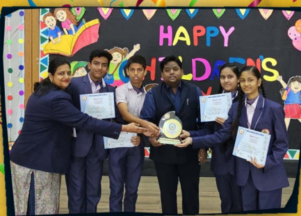
Our champions secured best Research Chemistry, in Indore Sahodaya Bal Vigyan.