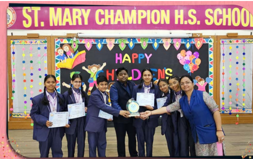
Our Champions Secured Best Idea Related To Theme - Social Studies, in Indore Sahodaya Bal Vigyan.