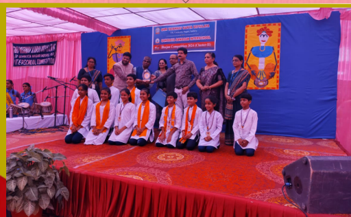
Our Primary Champs excelled in CBSE Sahodaya Inter School Bhajan Competition competing with 17 Schools